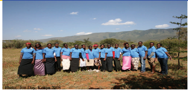
Kenya 2008